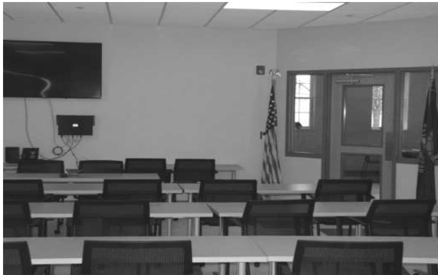
Training room funded by an Emergency Management Performance Grant